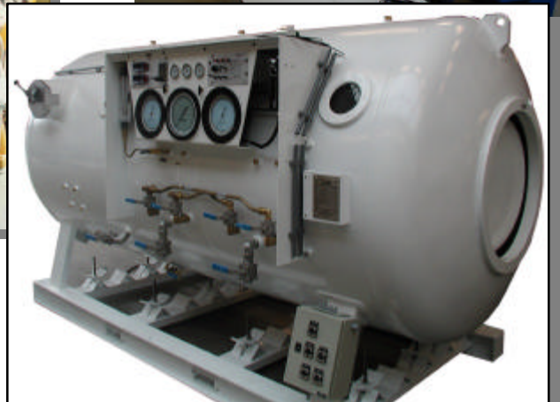
Hytech Decompression Chambers