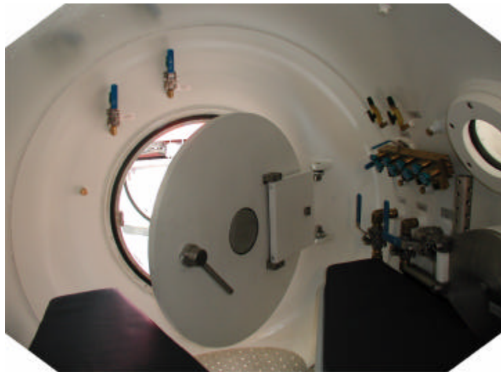
Inside view of decompression chamber

An oxygen supply is available in both the main chamber and the entrance lock. Both compartments have a BIBS system, using overboard-dump masks. This means the exhaled oxygen is discharged outside the tank, to prevent a high oxygen level inside the chamber. A communication system is also provided in both compartments. In case all fails, a small hammer is available for communication by way of knocking signals. The heating system and the silent, but very effective Hytech CO 2 scrubbers are mounted under the bunks.