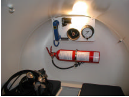
Comms & Lighting