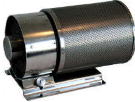
CO 2 Scrubber