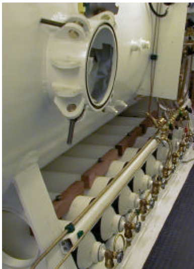
Air bank on skid

Both the inside and the outside of the chambers are coated with a special coating. Working pressure is usually 5,5 bars (80 psi), but chambers up to 35 bars (515 psi) can also be provided. For integration in existing systems, the chambers can be supplied with connection flanges to fit any bell or auxiliary chamber. The skid can be used to integrate the oxygen and air cylinders required to provide a maximum operational independence. The pressure hull has a number of spare penetrators that allow additional systems to be installed. A large size medical lock is a standard feature. View ports with a diameter of 150mm allow observation of both compartments.